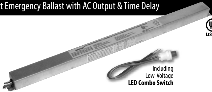
Including Low-Voltage LED Combo Switch